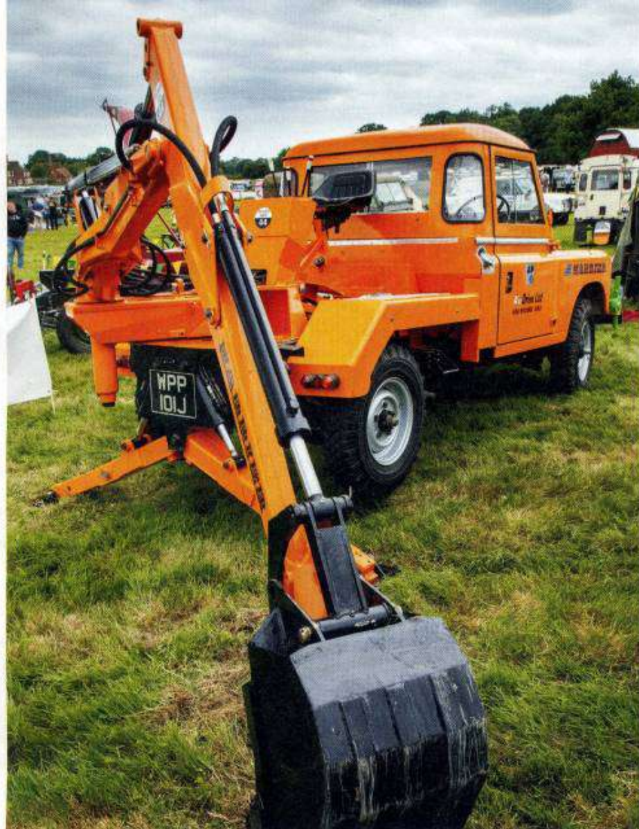
This page: Every type of Land Rover from prototypes to military and the weird and wonderful were represented