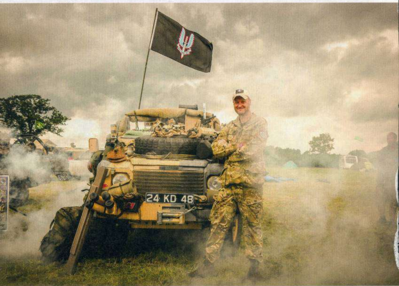
This page and opposite: Land Rover shows are about chatting to like-minded Land Rover fans and having fun with the family.

W hat makes a Land Rover Show great? Seeing and experiencing new things? Hanging out with like-minded Land Rover lovers from around the world? Buying new bits for your old Land Rover? Snuggling into your sleeping bag while listening to the gentle patter of rain on canvas? Dodgy German sausages washed down with the finest local ale? Well the first-ever Kelmarsh Land Rover show had it all in abundance.