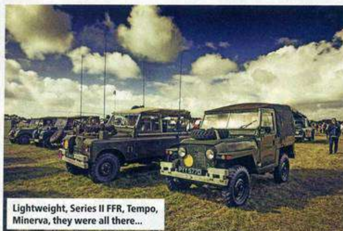
Lightweight, Series II FFR, Tempo, Minerva, they were all there...